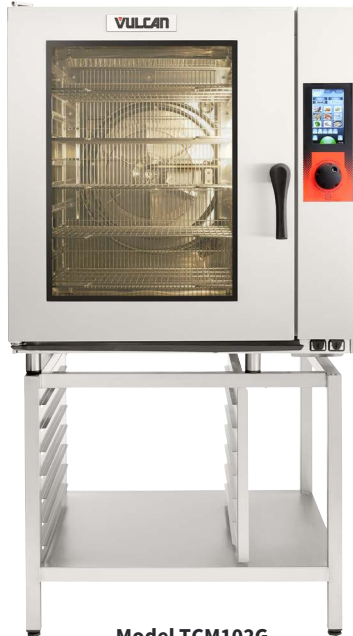
Model TCM102G Shown on optional stand