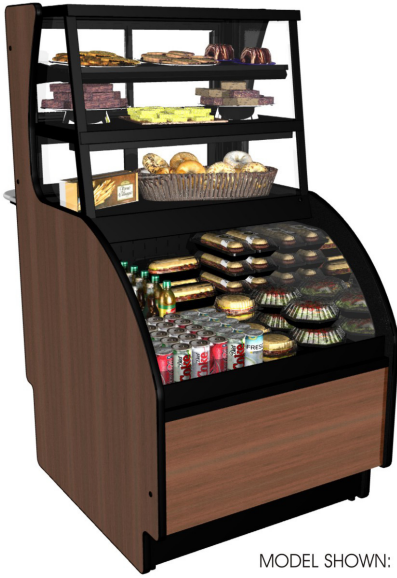
MODEL SHOWN: C3Z3667

Lengths include end panels 36"L x 41-7/8"D x 67-1/2"H 48"L x 41-7/8"D x 67-1/2"H