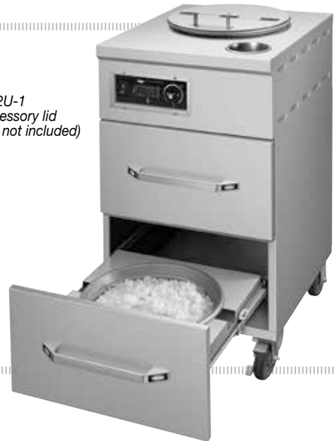
HRDW-2U-1 with accessory lid (rice pot not included)