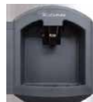
Easy Push Chute