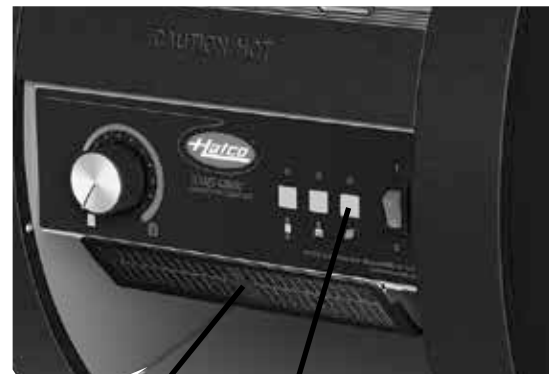
Air Intake Filter Screen